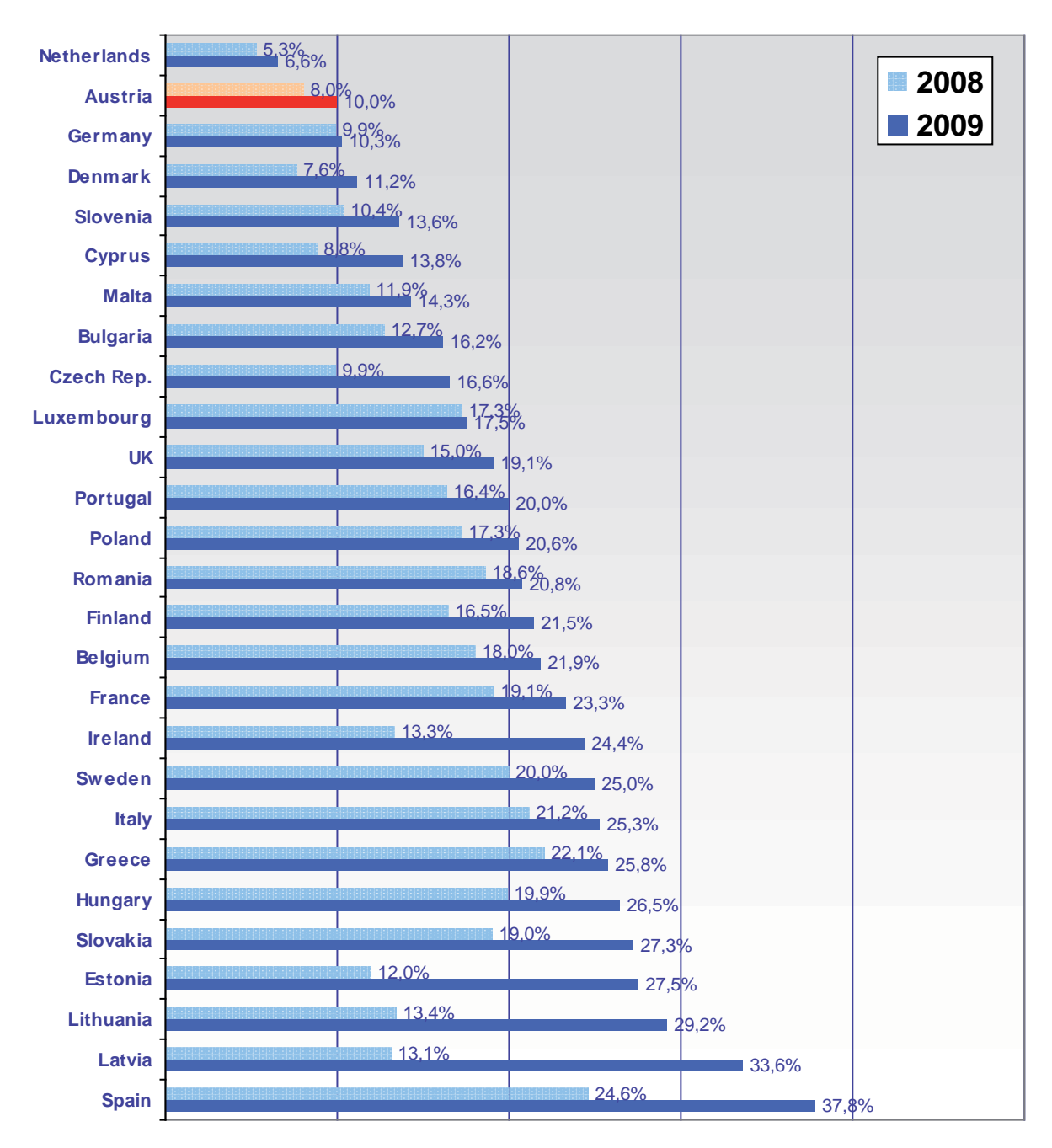
Graph 1: Unemployment rate of 15- to 24-year-olds (2008 and 2009, EU 27 countries, EUROSTAT method of calculation)